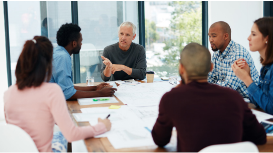
A focus on empowering people to meet compliance and business objectives.

supports safety on a daily basis and supports events such as accident investigations. Our service delivery takes a people-centric approach that is focused on empowering individuals and teams for success. We use our technical capabilities to get the right data and information into the hands of those that need it. We work with leaders and managers to help them understand how to influence their corporate cultures for safety and the highest levels of service to customers.